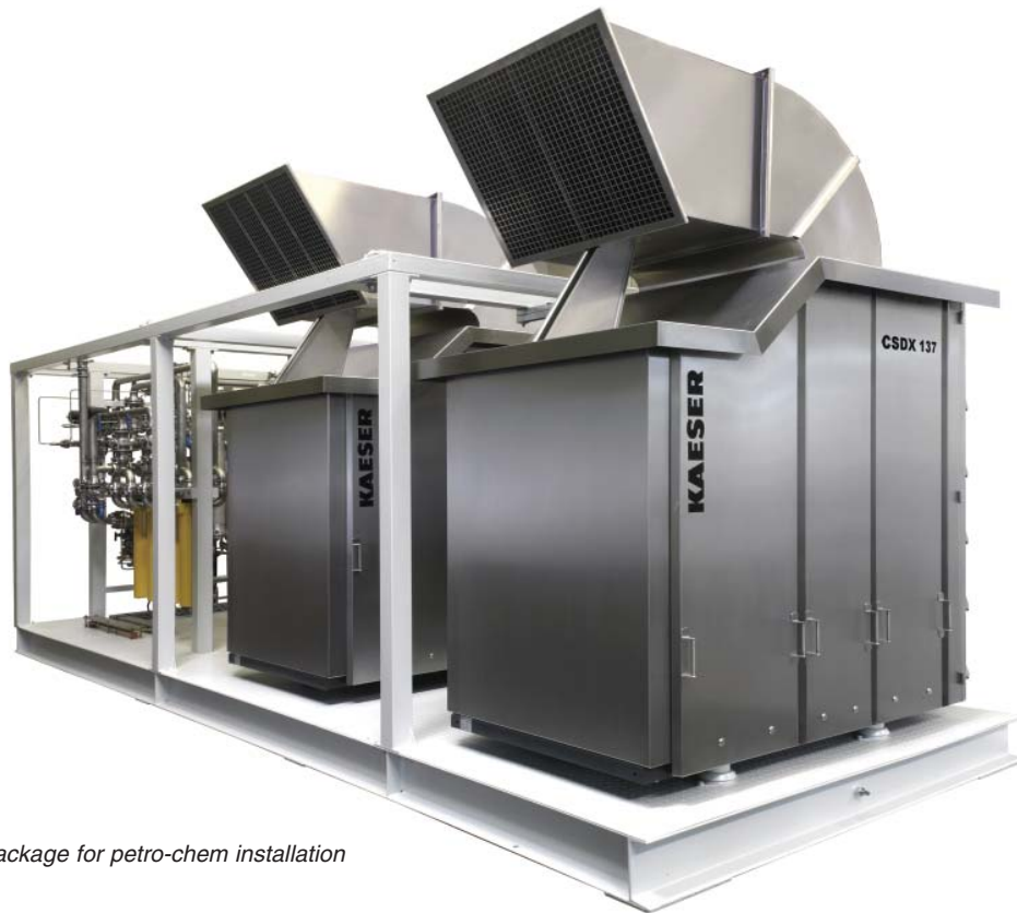
Outdoor instrument air package for petro-chem installation