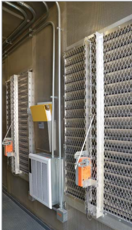
Thermostatically controlled louvers and enclosure heaters