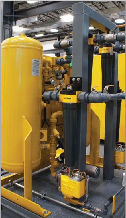
Full range of compressed air filtration