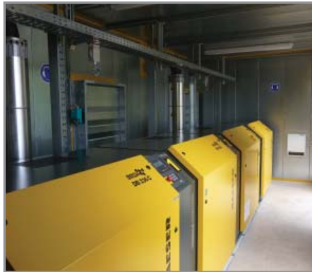
Complete blower packages with integrated controls