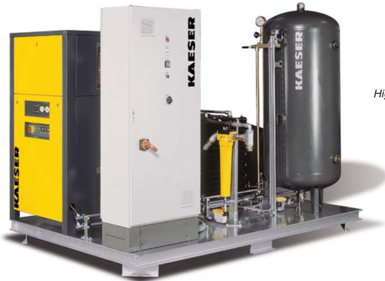
High pressure system for PET bottle making

Kaeser's skid-mounted offerings provide a complete compressed air system that's easy to transport without sacrificing on features or performance. They are the go-to choice for demanding manufacturing, petro-chemical, and other industrial applications.