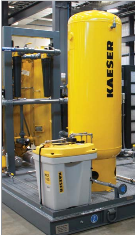
Air receiver tanks and condensate management