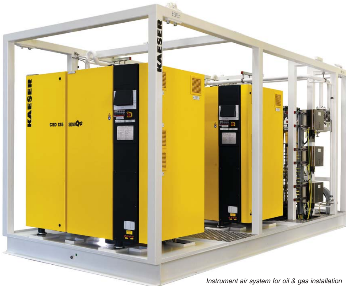
Instrument air system for oil & gas installation