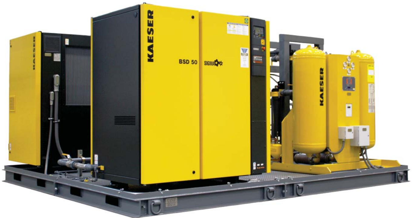
Instrument air for natural gas pumping station