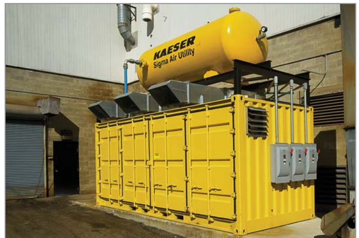
Plant air system for engine parts manufacturer