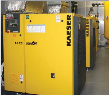
Rotary screw compressors