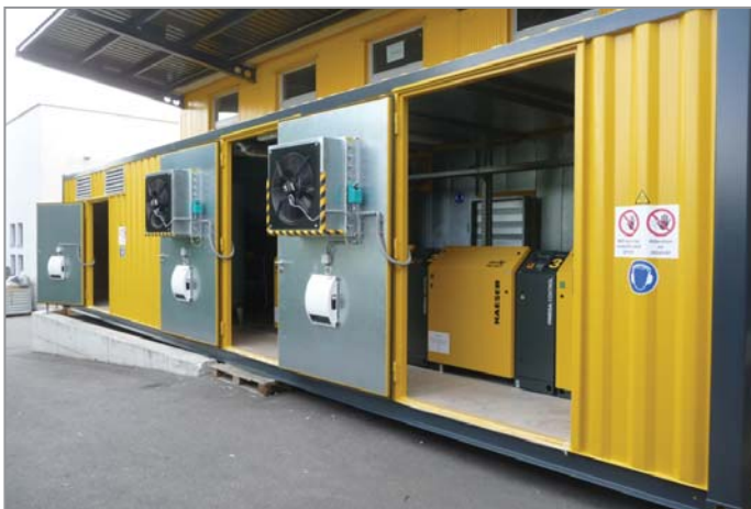
Blowers for wastewater aeration

Our modified ISO shipping containers are built for easy transport and ruggedness. They can be permanent installations, but are ideal for rental installations, construction sites, or other situations where a temporary source of compressed air might be needed.