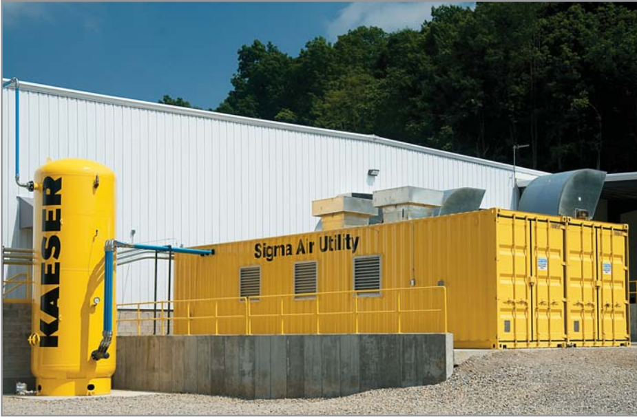
600 total hp for an automotive parts manufacturer

Do you produce your water, gas, and electricity? Probably not. So why own and operate compressors if you don't have to. Let Kaeser—The Air Systems Specialist—plan, install, and maintain a complete air system in your plant, so you can focus on running your business.