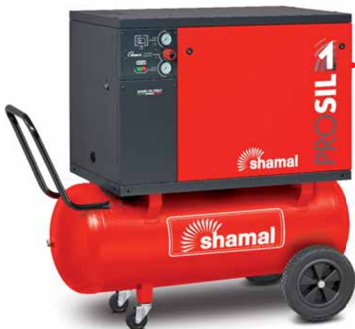
PROSIL K11/100 CM2